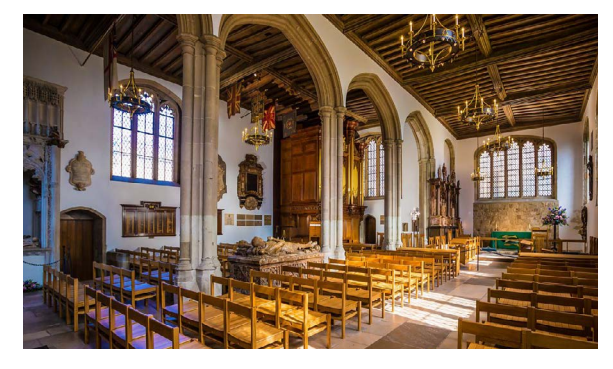
St Peter ad Vincula, HM Tower of London